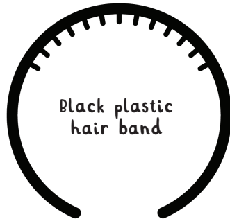
Black plastic hair band