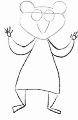
3. Draw a long triangle for the body and add his legs below it. Add some banana shapes for his arms.

2. Add some mouse ears on top and indicate the eyes. Add another triangle below the eyes.