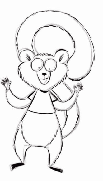
6. Go over your pencil lines. Add his nose, mouth and T-shirt as shown. You can change his expression if you like!